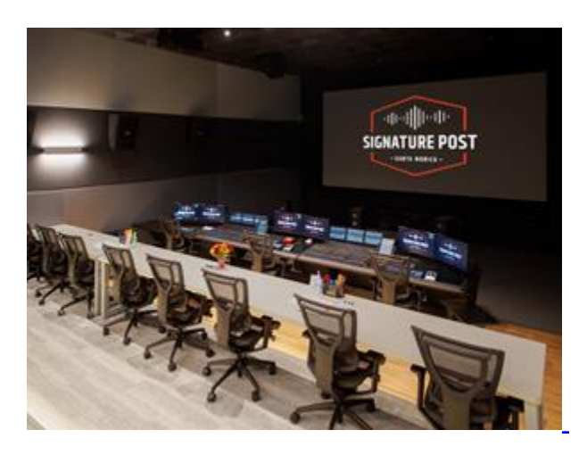
Signature Post opens Santa Monica mix facility with Avid solutions.